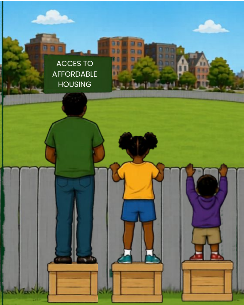
EQUALITY Giving everyone the same resources